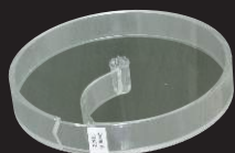
Friability drum Part no - 0401A00009 (Position A) Part no - 0403A00013 (Position B)