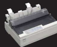
Epson LX 300 Plus printer Part no - 1501C00001