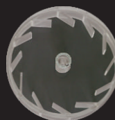
Abrasion drum Part no - 0401A00008 (Position A) Part no - 0403A00012 (Position B)